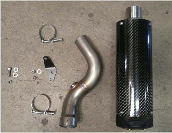
Slip-on Kit with Discs / End Cap assembly installed. Note: Muffler body mounting clamp & rubber extrusion not shown.