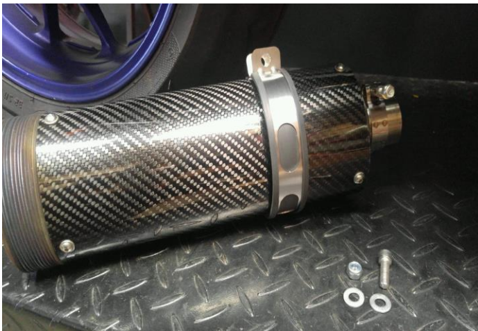
E-SERIES MUFFLER ASSEMBLY WITH BODY MOUNTING CLAMP, RUBBER INSULATOR EXTRUSION, AND INLET T-BOLT CLAMP INSTALLED.