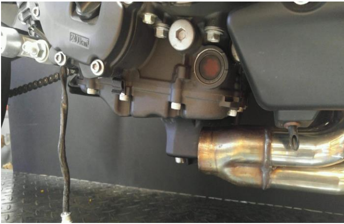
Modified cut headpipe with collector spigot.