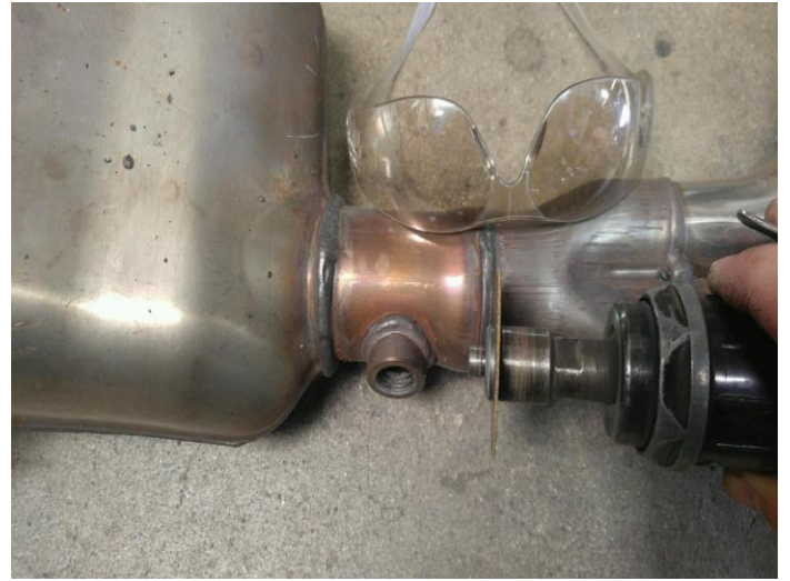
Cut OEM muffler off along weld seam to headpipe collector. Keep spigot length as long as possible.