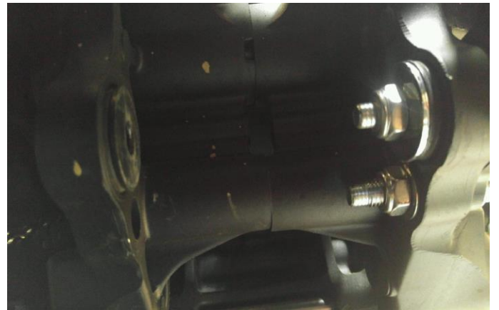
Backside of black mounting bracket bolted through frame boss with new Nylock nuts and washers installed.