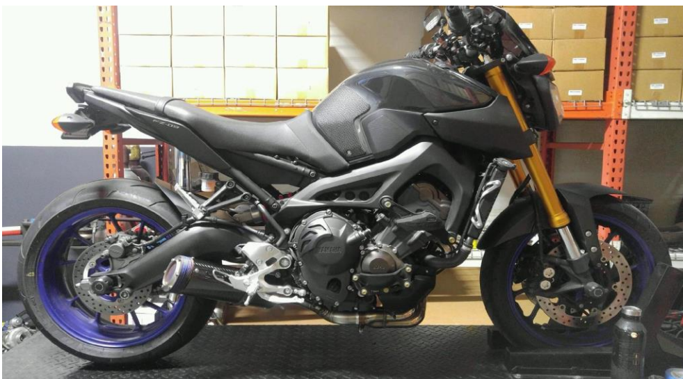
COMPLETED, FINAL, INSTALLED.