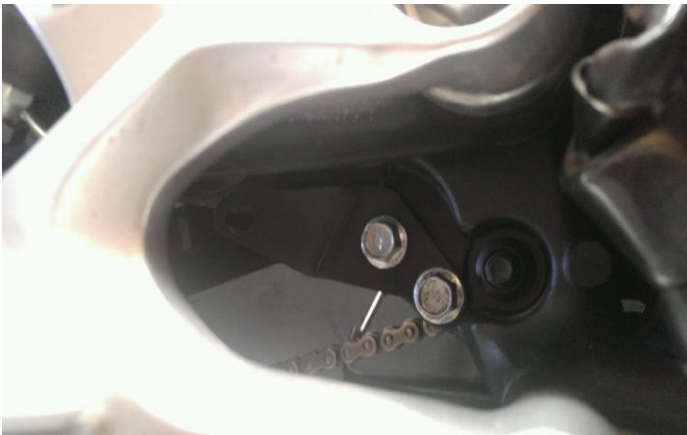
Black mounting bracket installed. Use OEM bolts and new Nylock nuts provided.