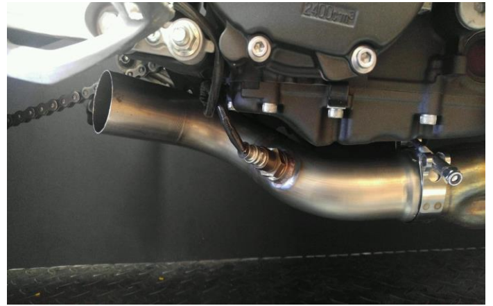
E-Series mid-pipe installed / positioned onto headpipe collector spigot. T-Bolt clamp and O2 sensor installed.